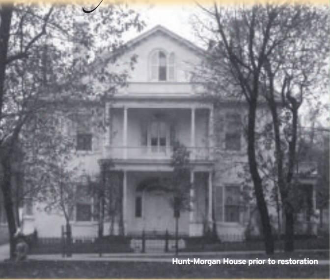
Hunt-Morgan House prior to restoration

THE BLUE GRASS TRUST was founded in 1955 by a spirited group of Lexington citizens who were determined to save the John Wesley Hunt residence from demolition. The group raised funds to purchase and restore the property, now known as the Hunt-Morgan House, to its original 1814 Federal style appearance. Today, the house stands as a testimonial to the beginning of The Blue Grass Trust and the birth of the preservation movement in Central Kentucky. Over the years, the Trust has helped save many other historic structures such as the Dudley House, Shakertown of Pleasant Hill, the Adam Rankin House, Henry Clay's Law Office, Belle Breezing's Row Houses, the Mary Todd Lincoln House, the Stilfield Log House and the Senator John and Eliza Pope Villa.