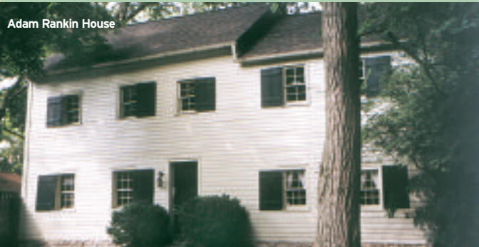
Adam Rankin House