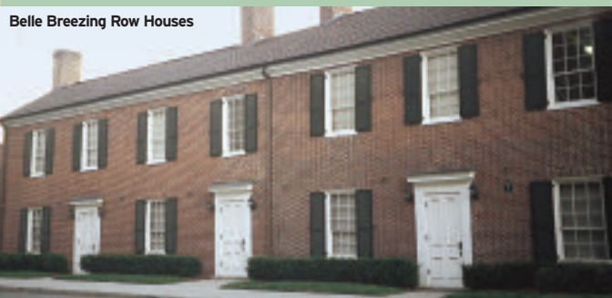
Belle Breezing Row Houses